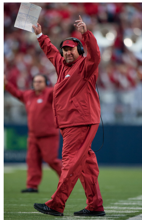
Thursday night's season opener against Florida A&M will mark the 12th time coach Bret Bielema has faced an FCS opponent during his 11-year head coaching career. He is 11-0 in those contests.