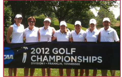
2012 Franklin, Tenn./The Legends Club MAY 22-24, 2012 || Par 72, 6264 Yds