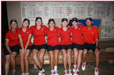
2011 Bryan, Texas || Traditions GC May 18-21 || Par 72 || 6,260 Yds