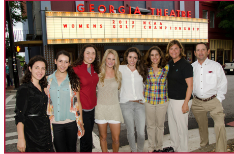
2013 Athens, Ga. || UGA Golf Course May 21-24, 2013 || Par 72 || 6,372 Yds