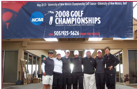
2008 Albuquerque, N.M. || UNM Course May 20-23 || Par 72 || 6,424 Yds