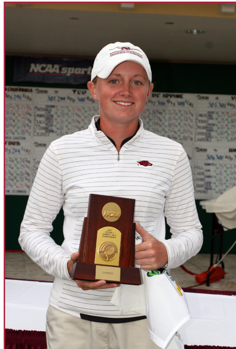
2007 Daytona Beach, Fla. || LPGA In'L May 22-25 || Par 72 || 6,351 Yds