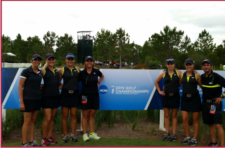
2015 Bradenton, Fla. || Concession GC May 22-25, 2015 || Par 72 || 6468 yds