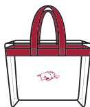
A CLEAR TOTE PLASTIC, VINYL, OR PVC AND NO LARGER THAN 12" x 6" x 12" LOGOS NO LARGER THAN 4.5" x 3.4" MAY BE DISPLAYED ON ONE SIDE