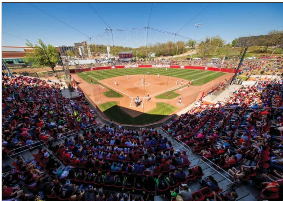
As part of their 2018 schedule, the Razorbacks are set to play 25 home games at Bogle Park and will face 12 teams overall that played in last year's NCAA Tournament including five that advanced to the Super Regionals.